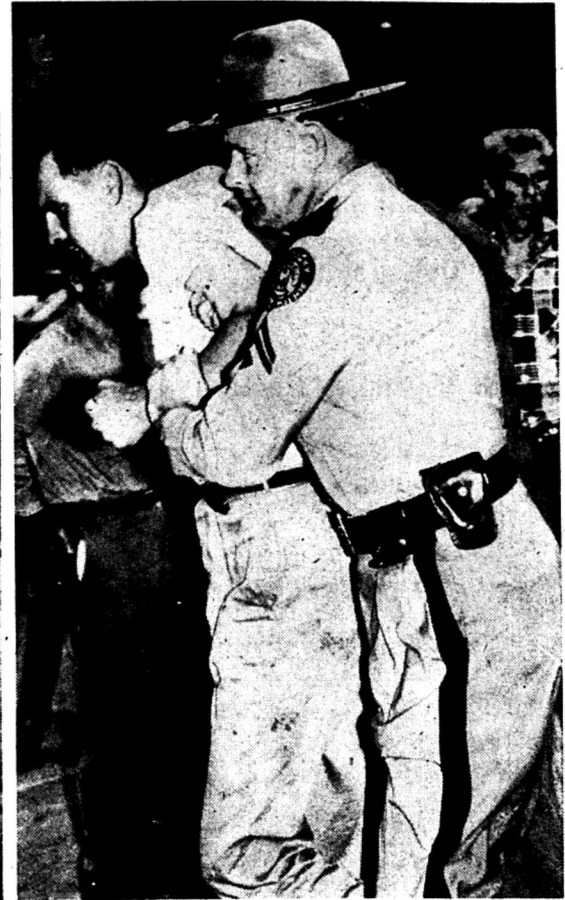
A Kentucky State policeman takes a man into custody after one of many fights outside Sturgis (Ky.) High School yesterday.